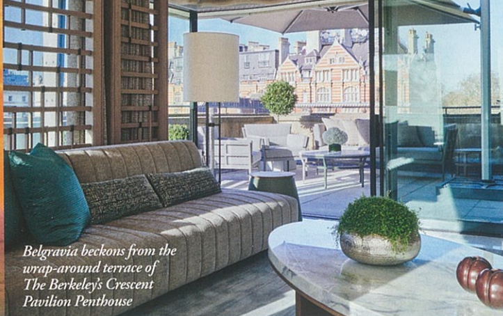
Belgravia beckons from the wrap-around terrace of The Berkeley's Crescent Pavilion Penthouse