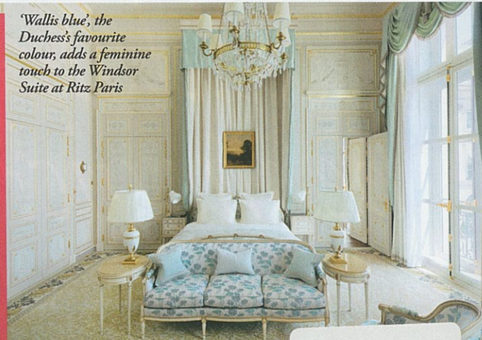
‘Wallis blue’, the Duchess’s favourite colour, adds a feminine touch to the Windsor Suite at Ritz Paris