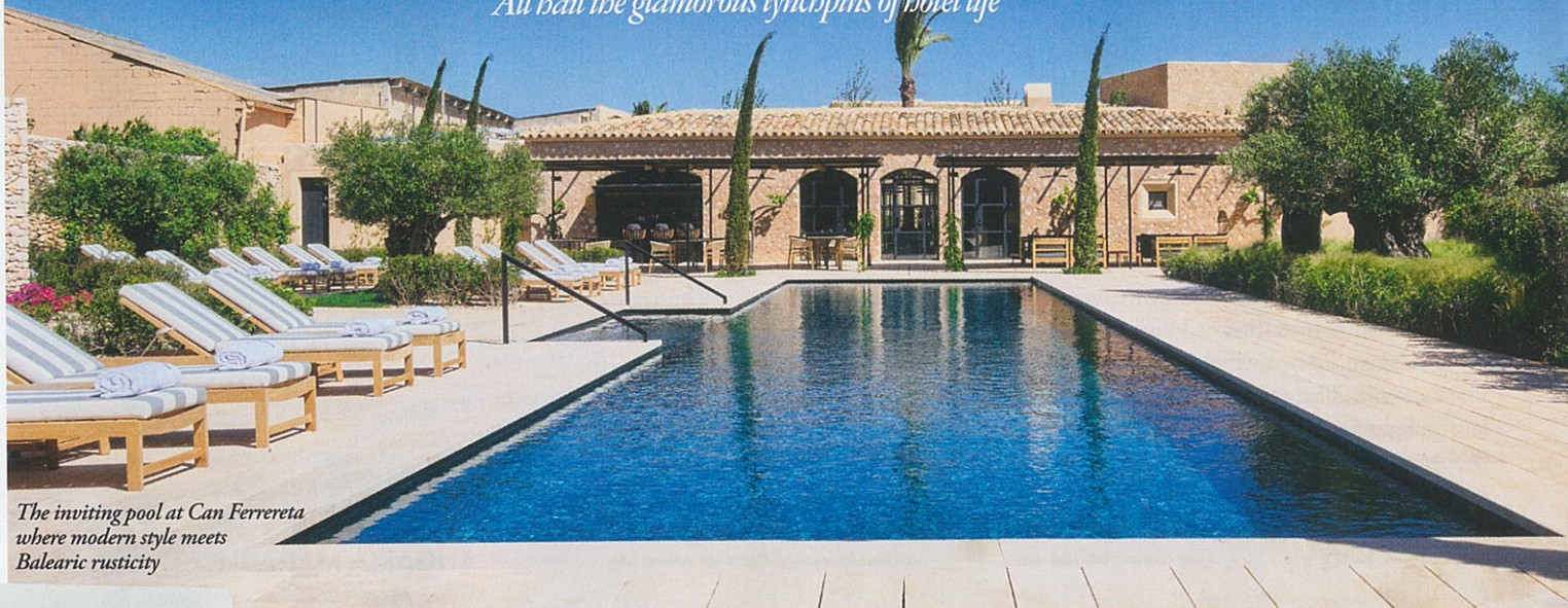
The inviting pool at Can Ferrereta where modern style meets Balearic rusticity

They're smooth, they're sharp, they make things happen. All hail the glamorous lynchpins of hotel life