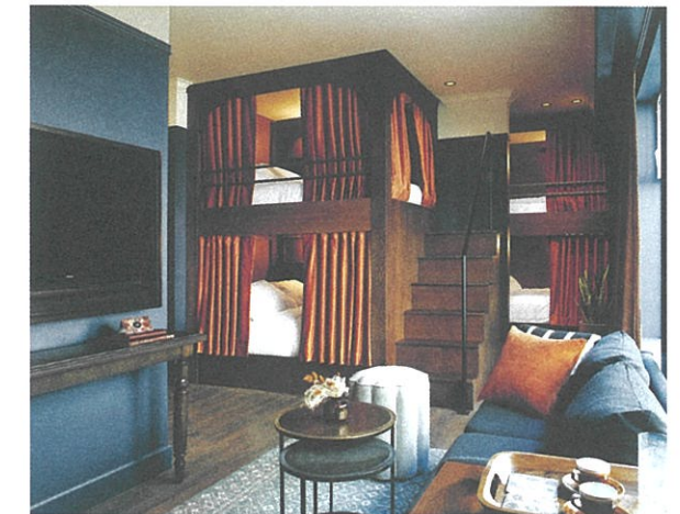
WANDER THE RESORT PRINCE EDWARD COUNTY, CANADA

Don't be fooled by this hip Colorado hotel's unassuming exterior: inside, magnificent velvet chairs grace sleek wooden floors scattered with cowhide rugs and peppered with grand, Victorian-era embellishments. Telling the story of its industrialist past, the property's 16 upstairs bedrooms range in size from basic, compact spaces sporting bunk beds to luxurious – and sprawling – king suites. Meanwhile, in-room wellness programmes, rain showers and Le Labo bathroom products firmly root guests very much in the 21st century.