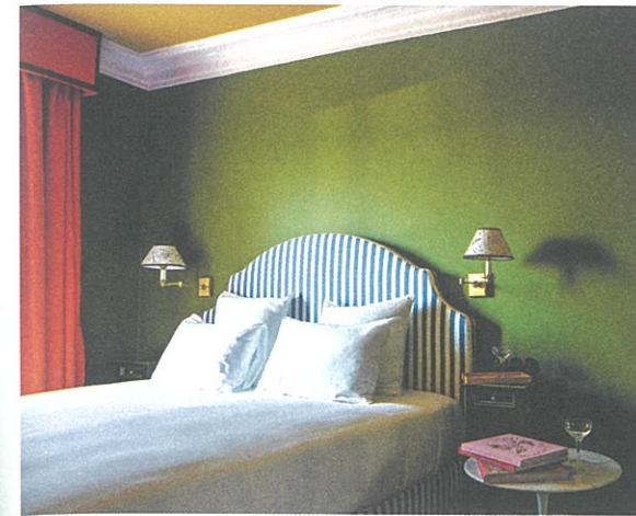
HOTEL LES DEUX GARES PARIS, FRANCE

Conveniently sandwiched between Gare du Nord and Gare de l'Est, interior designer Luke Edward Hall's first foray into hotels exudes playfulness: the flamboyant, art deco-inspired bolthole blends English elegance with chic French flourishes to spectacular effect. Funkily imagined and representing brilliant value for money, the vibrant guest rooms look out onto a picture-perfect Parisian skyline. Downstairs, a sultry bistro is the place to savour traditional French fare served alongside a fine selection of native natural wines.